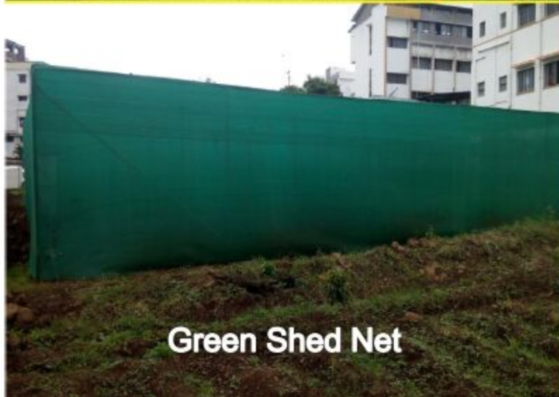
Green Shed Net