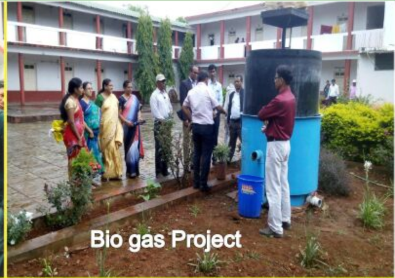
Bio gas Project